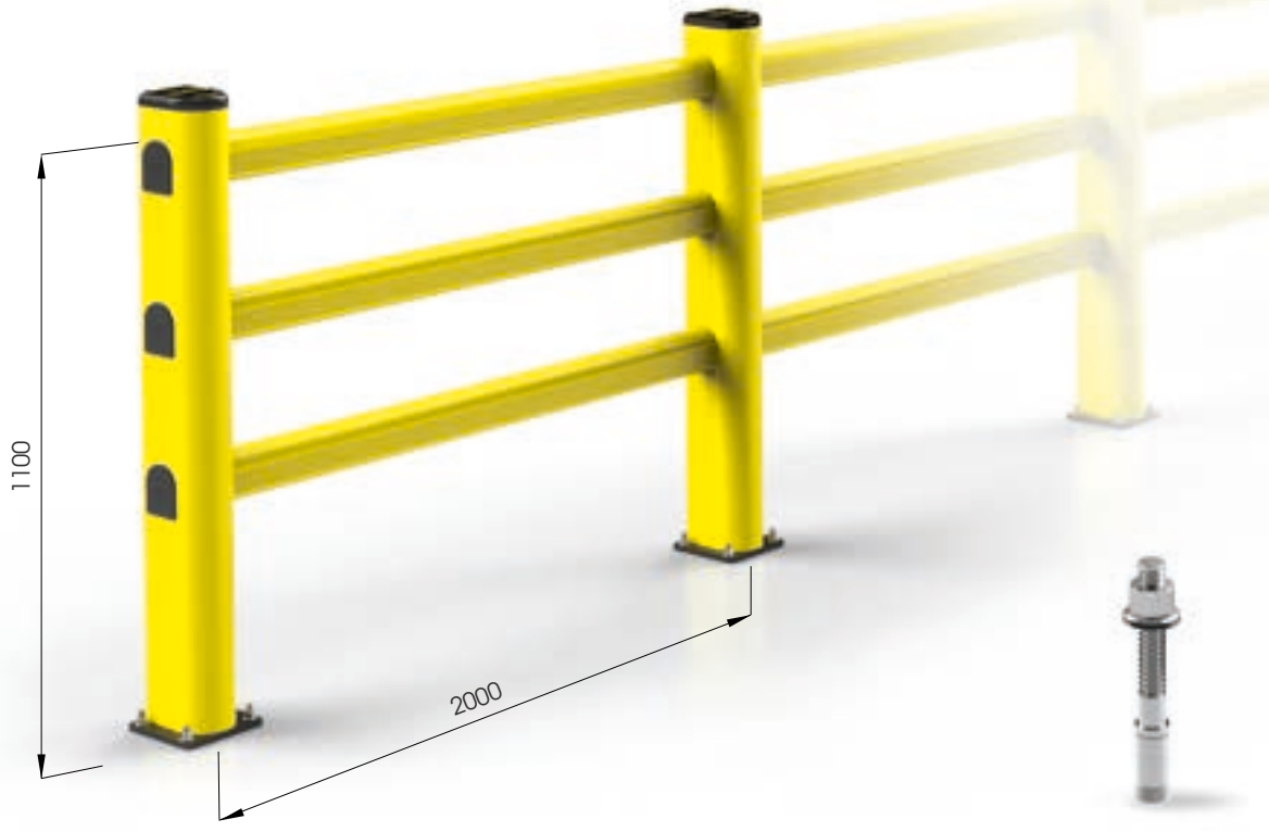
M12 GALVANISED STEEL